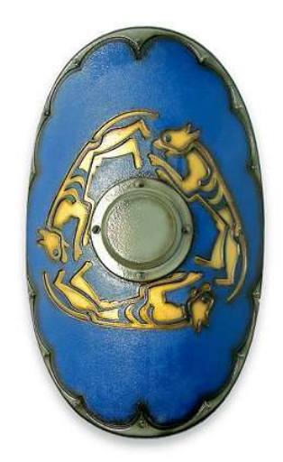
Shield of the Order of Krondahar