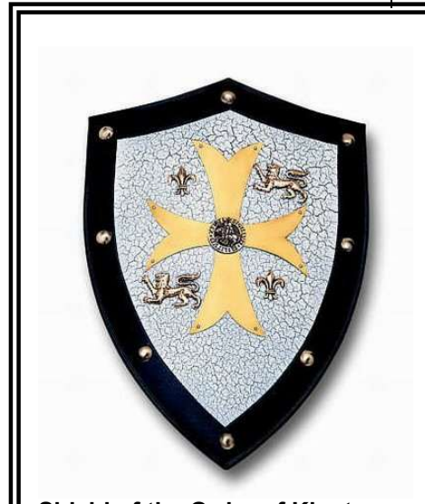
Shield of the Order of Klantyre

Their Code of Conduct imposes to always keep their word and fulfill their promises. This is sometimes taken to the extreme, as knights of Krondahar may leave all of their duties if they are pursuing something they need to fulfill a promise. These knights have the same