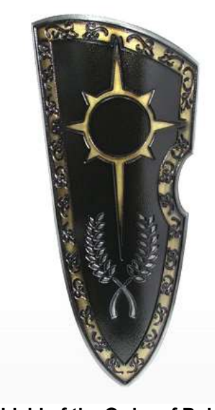
Shield of the Order of Belcadiz