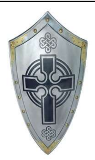
Shield of the Order of La Nouvelle Averoigne